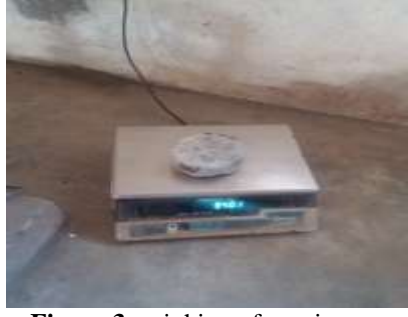
Figure 3 weighing of specimens