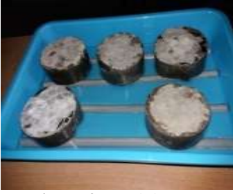
Figure 2 sorptivity test