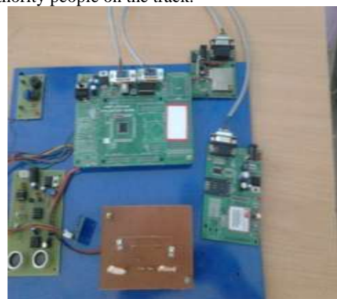
Figure.3. Hardware implementation

Whenever MEMS output value is increased than the predefined range(normal vibration) then the train stops and position of the crack is calculated and sends the message to the authority people on the track.