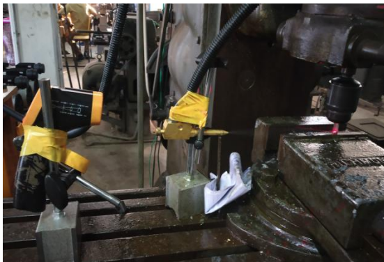
Fig.2: Experimental set-up with a 60 mm of nozzle distance at constant cutting conditions with minimum quantity lubricant (MQL) setup.

The surface roughness and temperature measurement was done using SJ-401 surf-test instrument and infrared sensor respectively. From surface roughness tester the measurement of Ra (Based on the ISO standard, surface roughness average Ra was calculated as the arithmetic