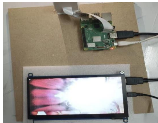
Fig 5.1: Before glare suppression