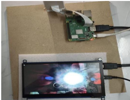
Fig 5.2: After glare suppression