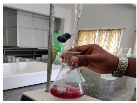
Fig.1 hardness test

The burette is filled with standard EDTA solution to the zero level. Take 50ml sample water in flask. If sample having high Calcium content, then take smaller volume and dilute to 50ml.