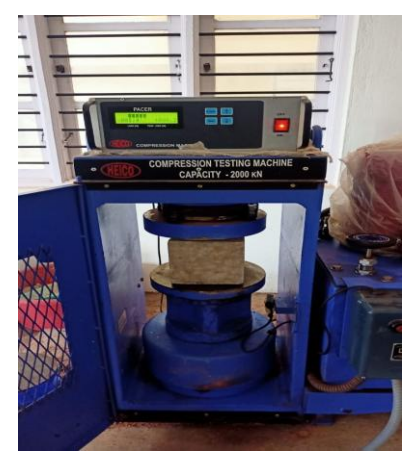
Fig.4 compression test

The compression testing machine used for testing the cube specimens is of standard make. After the required period of curing, the cube specimens are removed from the curing tubs and cleaned to wipe off the surface water. It is placed on the machine such that the load is applied centrally. The smooth surfaces of the specimen are placed on the bearing surfaces. The top plate is bought in contact with the specimen by rotating the handle. The oil pressure valve is closed and the machine is switched on. A uniform rate of loading 140 kg/sq.cm/min is maintained. Tabulate Compressive strength for each cube and calculate average value for each mix.