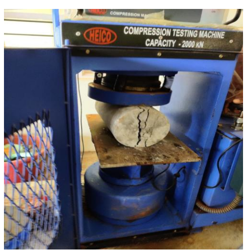
Fig.5 Tensile test

Tensile testing machine, two packing strips of plywood 30 cm long and 12 mm wide, mould, tamping bar (steel bar of 16 mm diameter, 60 cm long), trowel, glass or metal plate. After curing, wipe out water from the surface of specimen Using a marker, draw diametrical lines on the two ends of the specimen to verify that they are on the same axial place. Measure the dimensions of the specimen. Keep the plywood strip on the lower plate and place the specimen. Align the specimen so that the lines marked on the ends are vertical and cantered over the bottom plate.