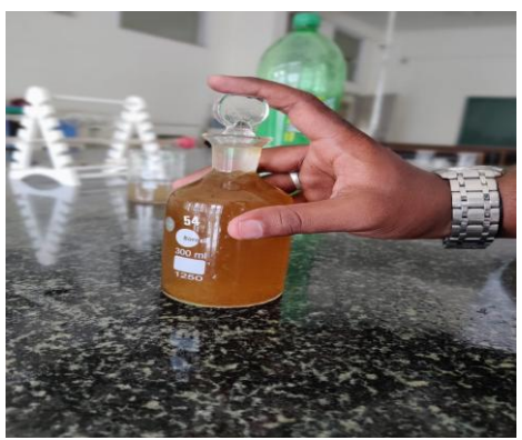
Fig .2 BOD test

Collect the water sample from a pond. Carefully fill a BOD bottle with sample water without making air bubbles. Add 2ml of manganese sulphate to the BOD bottle carefully by inserting the pipette just below the surface of water. So that you can avoid the formation of air bubbles. Add 2 ml of alkali-iodide-azide reagent in the same manner. Close the bottle and mix the sample by inverting many times. A brownish cloud will appear in the solution as an indicator of the presence of Oxygen.