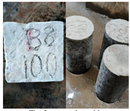
Fig. 3 prepared moulds