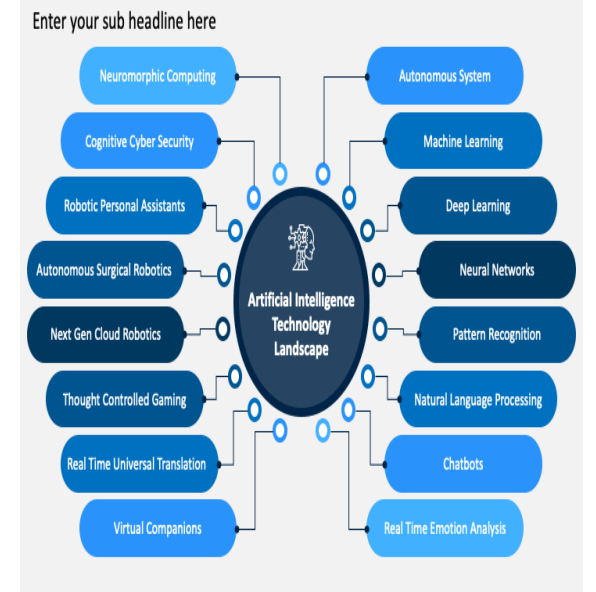
Figure1. Artificial Intelligence Applications