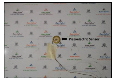
Fig. 4.Load cells (piezoelectric sensors) fixed on mica