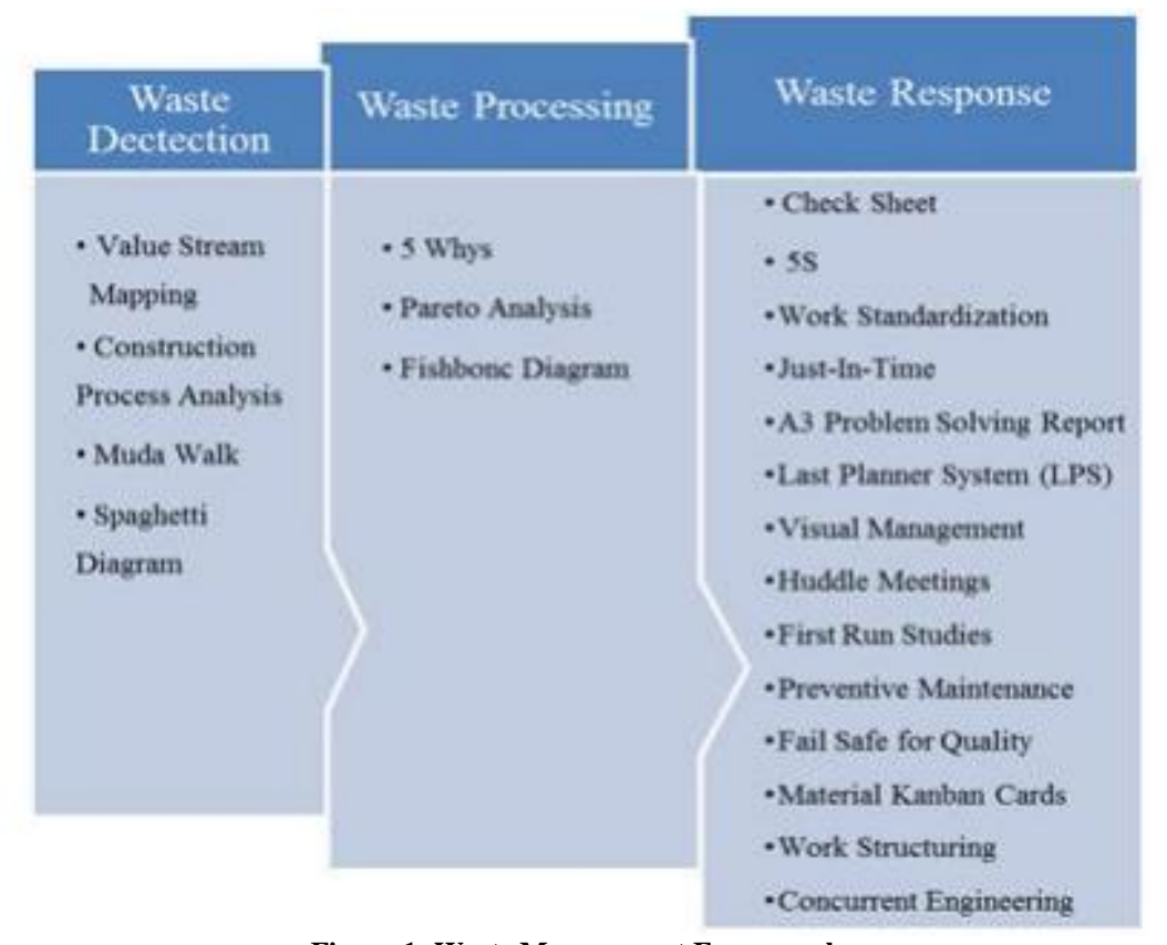
Figure 1: Waste Management Framework

In insistence of the composing opening and how to fill this opening, this paper through complete composing perceives some sensible lean instruments for extra trial demand concerning development project progression.