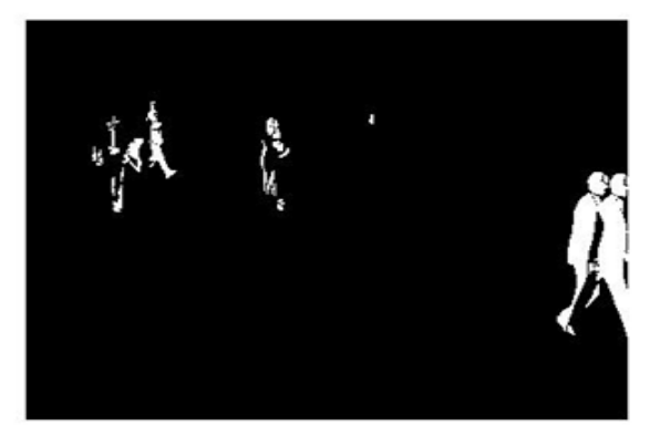
Figure3. Removed image

The background subtraction algorithm is used to detect the moving objects on the basis of Gaussian mixture models. The application of morphological operations is done for the resulting foreground mask so that noise is eliminated.