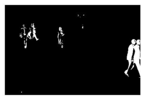
Figure2.Feature extracted image

Finally, the groups of connected pixels are detected using the blob analysis, which will show a correspondence to the moving objects.