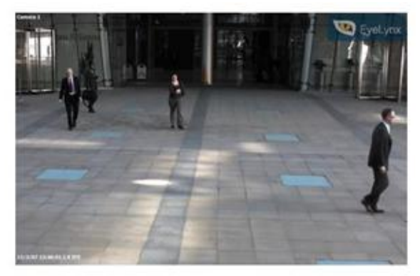
Figure 1 .Original image