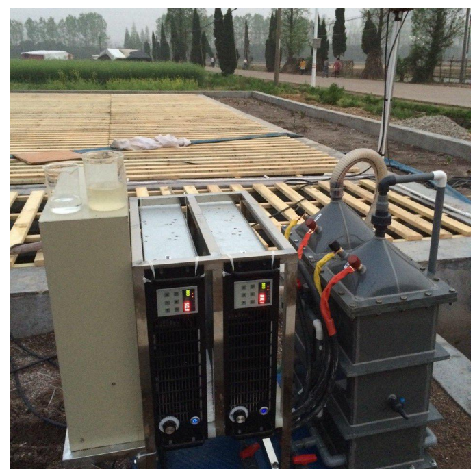
Fig. 4 Wastewater treatment unit by electrocoagulation and electrooxidation

International Journal of Engineering Research and Applications www.ijera.com ISSN: 2248-9622, Vol. 10, Issue 6, (Series-VIII) June 2020, pp. 41-48