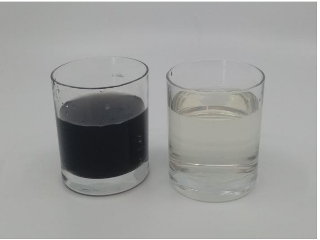
Fig. 3 Wastewater before and after treatment with electrokinetics

Electrooxidation processcan destroy organic and toxic pollutants that are dissolved in wastewater by direct or indirect oxidation. The direct oxidation process occurs on the anode as it first absorbed the pollutants on the surface and then an anodic electron transfer reaction happens. Due electrolysis to strong oxidants such as hypochlorite/chlorine, ozone or hydrogen peroxide can be generated by the electrochemical reactions. The pollutants in wastewater are then destroyed by the strong oxidants by chemical reaction in the solution. Many scientists have reported about successful electrooxidation with regard to many specific pollutants, such as ammonia, hazardous dye, etc., but also the general reduction of COD. The electrooxidation process does not need a