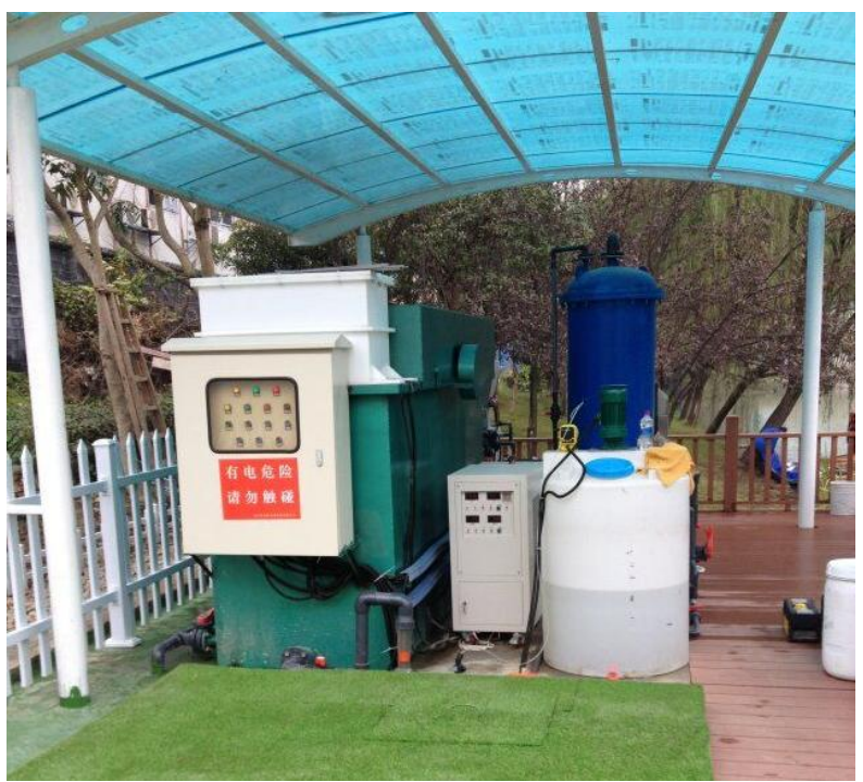
Fig.6Wastewater treatment device in Hangzhou City for a food market

The second device was designed for the treatment of wastewater originated from a vegetable market on a river side. This device operated in electrocoagulation mode only (Fig. 6).