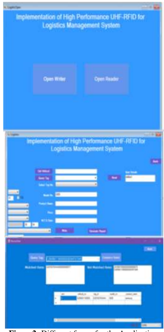
Figure2: Different forms for the Application

An Application is developed using Visual Studio to integrate with the System. User can open the application for writing data to tags at the Source and reading the data from the tags at the destination. The forms for writing the data and reading the data are shown in Figure 2.