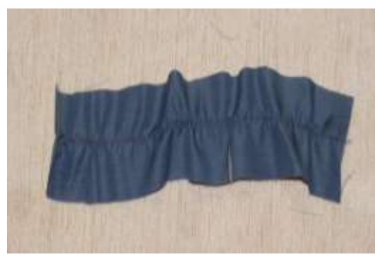
( Fig.No.1- Occurrence of Seam Puckering

would also be studied on the base of seam puckering coefficient.