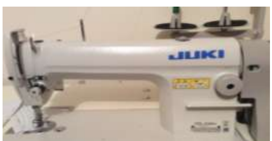
(Figure no.2, Single Needle lock stitch machine)