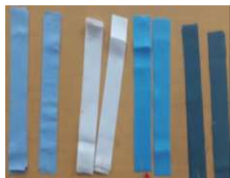
(Figure no.3-Sample preparation)

In second stage, we prepared the samples with measurement of 30*5 Centimeter (approximate 12*2 inches). We prepared the samples in warp & weft direction of each fabric samples.