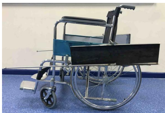
Fig.2 Ramp attachment for standard manual wheelchair.