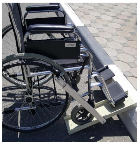
Fig.3 Prototype using Glass Reinforced Plastic (GRP)

Initially the ramps on both sides unlocked by loosening the lock nuts and position it according to the height of curb using the connecting rod. Once the ramps are firmly placed on the curb initiate the climbing process by self or with the help of accompanying person. The slider mechanism facilitates the climbing of wheelchair through the ramp. Once the wheelchair landed safely the ramps will be on the backside of the wheel chair. The ramps can be then take upside for putting back on the side frame and locked firmly with the lock nuts.