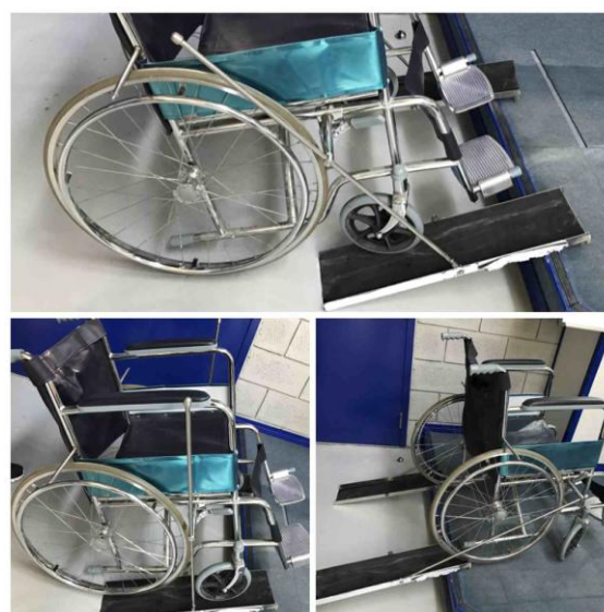
Fig.4 Wheelchair climbing curb using ramp attachment.

Before the final fabrication a prototype developed using Glass Reinforced Plastic (GRP) tray and rectangular tubes for testing and deciding on the final design.