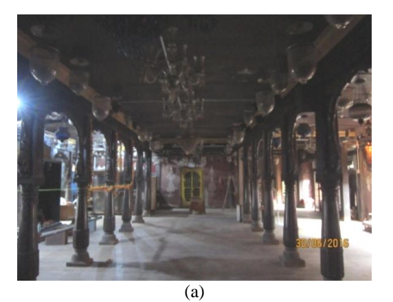
(b) Figure 10 (a) Hall (Diwankhana) in Vishrambaug Wada (Traditional Case ) (b) Hall (Diwankhana) in Dhepe Wada (Contemporary Case)

Hall interior of Dhepe Wada is like traditional Wada.The hall of the Dhepe Wada is embellished with columns, cupsed arches, ornate ceilings and hanging lamps very typical of every Maratha and peshwai edifice. But columns in