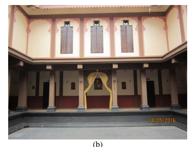
Figure 5 (a) Courtyard (Third Court) in Vishrambaug Wada (Traditional Case) (b)Courtyard in Dhepe Wada (Contemporary Case)

Dhepe Wada has the single courtyard Wada. The Court is utilised for various functions as in old days. Court has open verandas with pillars around and behind them there are the enclosed rooms on the ground floors and the upper floor is enclosed with walls. Spatial configuration is same as Vishrambaug Wada but wood has been used as the material of column and beam has been replaced by RCC material. All the first floors have ornamental wooden windows facing the courtyard. The flooring of the chowk and the surrounding plinth are usually made of stone. Vishrambaug Wada is an exemption but it is clearly visible in Dhepe Wada. The Vishrambaug Wada is covered with timber roof on all wings. It has tiles over the wood finish. In Dhepe Wada timber roof has been replaced with galvanised iron sheets. These sheets are covered again with tiles showcasing typical feature of Peshwai architecture. On the interior facades of chowks in Vishrambaug Wada ornamental patterns are raised in the plaster in each bay. They are like floral garlands in the shape of the cusped arches as used in the window. Similar expression is visible in Dhepe Wada. The brackets