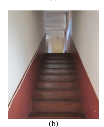
Figure 9 (a) One of the staircase in Vishrambaug Wada (Traditional Case ) (b) Staircase in Dhepe Wada (Contemporary Case)