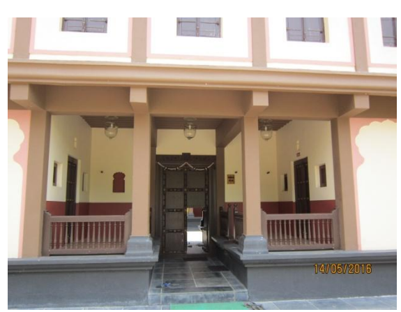
(b) Figure 4 (a) Entrance of Vishrambaug Wada (Traditional Case) (b) Entrance of Dhepe Wada (Contemporary Case)

This transitional space encourages residents and passers-by to pause for conversation and helps the residents of the Wada to get connected with the neighborhood socially. It provides an interactive space. In Wada platforms of threshold are slightly elevated so that they act as the mode of transition between built form and land. It provides shelter from sun and rain. This element has paramount importance which provides social, cultural. functional, climatic and religious implications. Similarly, the entrance to the Dhepe Wada has two platforms though the size, articulation and material of components of osari have been changed. In Vishrambaug Wada the entrance is constructed within seven bays, between two devadis which was used as a guard room whereas the entrance at Dhepe Wada consist of three bays and devadi replaced a pooja room forming the platforms. Columns are very decorative circular in shape and supported to balcony in Vishrambaug Wada. The cusped arch non structural member can also be seen at the entrance. The