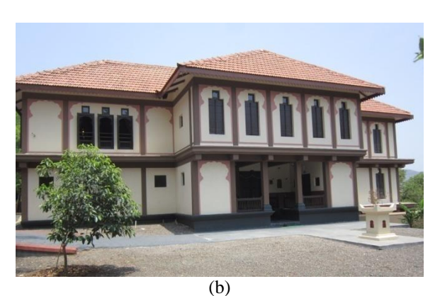
Figure 3(a) Eastern Façade of Vishrambaug Wada (Traditional Case)(b) Eastern Facade of Dhepe Wada (Contemporary Case)

Visrambaug wada's facade has a classic wooden balcony called meghadambari (a cloud capped balcony) projecting from it. Facade is very ornamented belonging to ruling class. Whereas, facade design of Dhepe Wada is simple in terms of carving, articulation of structural members.Dhepe Wada's facade does not have a balcony but there is an entrance projected out in plan.