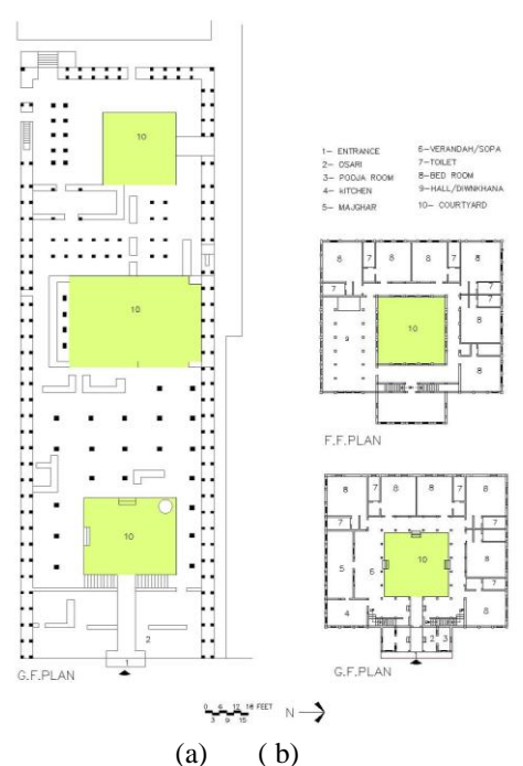
Figure 2 (a) Plan form of Vishrambaug Wada (Traditional Case) (b)Plan form of Dhepe Wada (Contemporary Case)

The planning and layouts of the Wadas were built around the concepts of a courtyard. The basic planning of all Wadas was introvert and chowk based<sup>5</sup>. Introvert planning provides the sense of enclosure and privacy to the residents of the house. There was a political agenda for adopting introvert planform by Marathas. Being warriors in order to protect their culture and religion against rulers (mainly Mughals), Marathas brought this style of planning. Security and defence were the planning strategy for a Wada. Number of chowks varied from a single chowk upto seven. For more than two courts, outer court used for Public and semi-public purpose and inner court was used for private. Zoning was the important aspect in Wada planning.Courtvard was also important symbolically, as it symbolised inwardness in the house. The centre space is the Brahma space as per vastu shahtra.Visrambaug Wada Figure 2a shows the courtyard patterned layout with three main courtyards one behind the other. The first courtyard is square in plan; the second one which is bigger is rectangular in plan and the third smaller courtyard. Vishrambaug wada is magnificent in size and scale. It shows the grid planning design. Structural grid was called as Khan and the bay formed by number