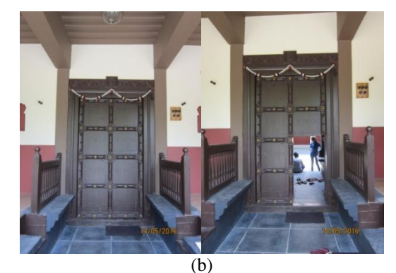
Figure 7 (a) Entrance Door in Vishrambaug Wada (Traditional Case ) (b) Entrance Door in Dhepe Wada (Contemporary Case)