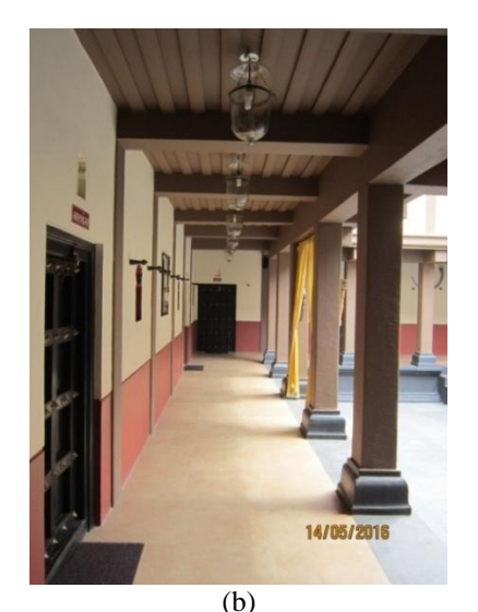
Figure 6 (a) Verandah in Vishrambaug Wada (Traditional Case ) (b) Verandah in Dhepe Wada (Contemporary Case)