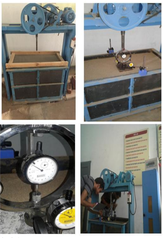
Fig 3.1 Experiment on Square Footings at u/B ratio 0.25 & 0.50