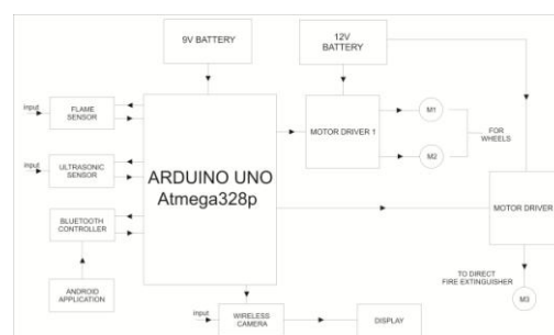
Fig 1: Block diagram