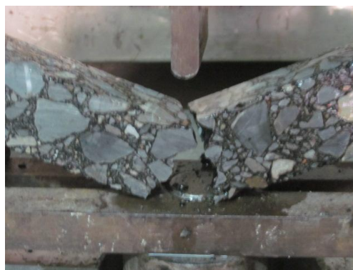
Fig3.2 the beam broke