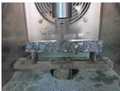
Fig3.1 the beam loading

machine, adjust the machine to the specified test temperature and after reaching a certain time. With three-point loading experiments, we record the maximum tensile strain, maximum tensile stress as well as the largest strain energy of the beams when the beams got broke. Loading and broke figure of beam are show on figure 3.1 and figure 3.2. Mixture ratio used AC-25 and its ratio shows in table 3.2.