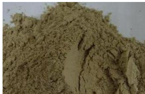
Fig2.2 the modifier of diatomite