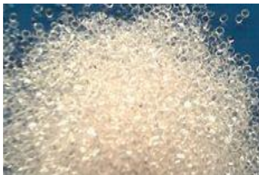
Fig2.1 the modifier of PE particles