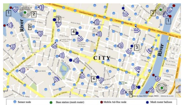
Fig 2. Networks in action. Sending, relaying and receiving alert messages during a flood disaster.

In Figure 2 is depicted the procedure to send, relay and receive alert messages.