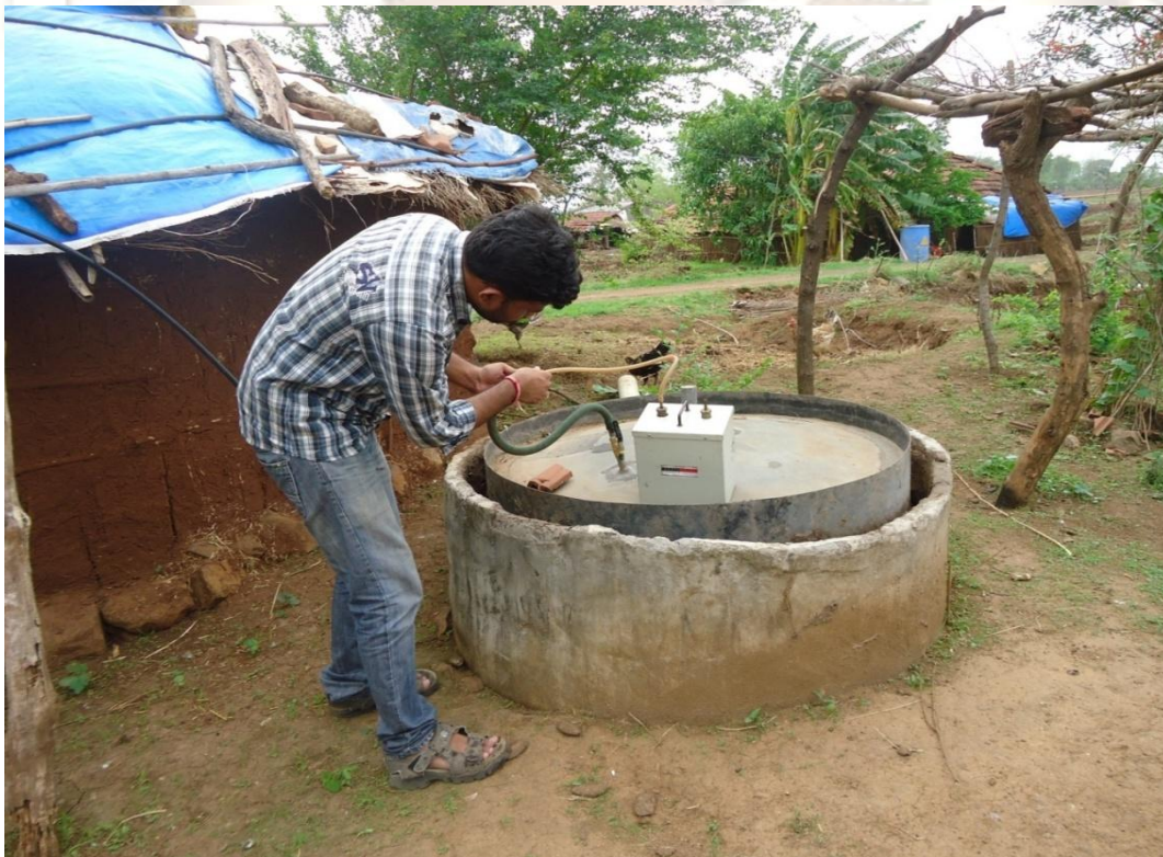
Figure 1: Determination of gas volume through dry gas meter

The two biogas digester types were fed with 25kg cow-dung equal volumes of water and thereafter a comparative study of the temperature regimes inside them was undertaken for a period of one month. And in assessing their performance, the two biogas plants were used to kept for a retention time of 10 days and during this time the fermentation of the slurry takes place through undergoing normal anaerobic digestion process where thermophilic reactions takes place. During this exercise, the biogas production and temperature were monitored daily using a dry-test gas meter and a digital thermometer respectively.