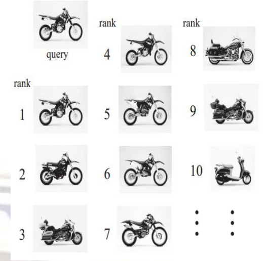
Figure 4: Result of CBIR using PCNN

In the results of the image retrieval using our CBIR system, it was shown that the images in relevant category were listed on top of the ranking. The characteristics of retrieved images have also been evaluated, and it is shown that the image recognition method using PCNN is valid for the CBIR system [2].