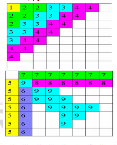
Figure 3: DCT-9 Feature Vectors [1].

Texture Feature Extraction: For efficient texture feature calculation, we can use DCT coefficients [5].