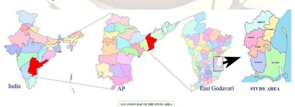
Fig. 1: Location map of the study area.

The Kakinada city (16°57<sup>°</sup>N: 81°15<sup>°</sup>E) is the capital of East Godavari District of Andhra Pradesh on the central east coast of India. Fig 1 shows the location of the study area.