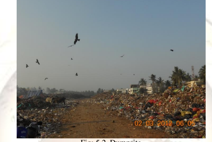
Fig: 5.2. Dumpsite

In Kakinada the solid waste disposal site cheedelapora is in the western side of the city with an average distance of 1km from the city. At present, they are not practicing any scientific processing and disposal of solid waste. The solid waste collected is being transported to the cheedelapora disposal site where is being disposed indiscriminately. Presently it is practicing open crude (R. Rajput et al, 2009) indiscriminate disposal of solid waste. At present, 260 tonnes of garbage a day is being collected from the households. It is being dumped at unauthorised dumping yard near saradamba temple - cheedelapora located amidst residential areas. Cheedelapora is the designated disposal site of municipal solid waste generated from city.