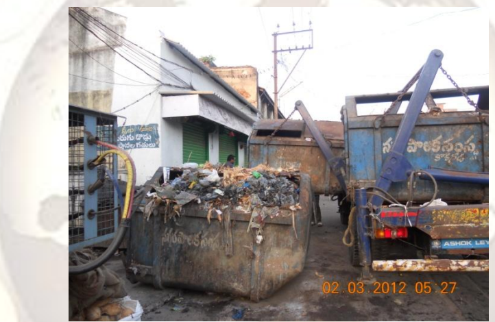
Fig: 5.1 Collection system

The collection and transportation of solid waste in Kakinada is done in two shifts. In the first shift that starts at around 5A.M early in the morning, the conservancy workers sweep the streets, clean the drains and collects the waste from small open points and transport the waste by wheel barrows or pushcarts or tricycles to nearest dumper bins or secondary open collection points. At some parts of the city, tippers go along with the sweepers and collect the waste which is being transported to transfer stations. Then from transfer station the waste is being collected and transported to the disposal site by tippers and open trucks.