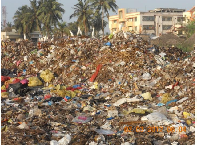
Fig: 5.3 Dumpsite to the adjacent houses

efficient method for assessing the quality of water The values of analysis of ground water at disposal site show results in table 5.12 and fig.5.2.