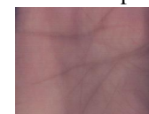
Extraction of Valuable part from the image