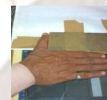
Scanning the image from simple flat scanner