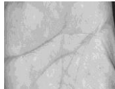
Grey Scaling of image