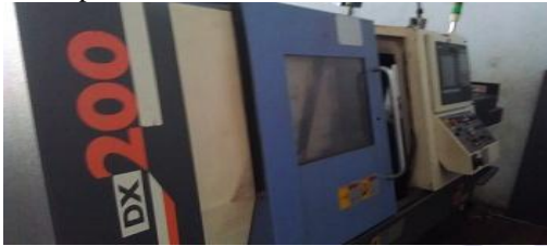
Fig 2.2: SIEMENS - 802D CNC

The experiments were carried out on a CNC turning centre machine (Siemens 802D) Core carbide engineering works Hyderabad India. Specimens of Ø25 mm x 75mm size were used for the experimentation.