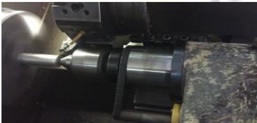
Fig 2.3: Experimental setup

The test specimen was mounted in a chuck. The experimental setup is shown in Fig.2.3. The required cutting speed, feed rate and depth of cut were incorporated in CNC part programming to perform the operations. Each sample was marked with corresponding trial number to identify the conditions used. The steps were repeated until the whole experiment was complete. The levels of the individual process parameters/factors are given in Table 2.2