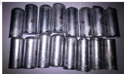
Fig 2.1: Al/SiC (5% & 10%) work pieces