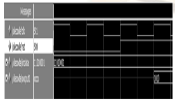
Fig 8: Modelsim waveform of viterbi decoder

Model simwaveform & Synthesis Report of viterbi decoder: