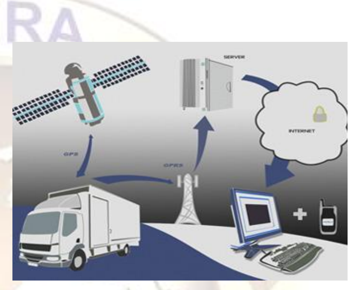
Fig.1.0 working of vehicle tracking system

A vehicle tracking system combines the installation of an electronic device in a vehicle, or fleet of vehicles, with purpose-designed computer software at least at one operational base to enable the owner or a third party to track the vehicle's location, collecting data in the process from the field and deliver it to the base of operation. Modern vehicle tracking systems commonly use GPS or GLONASS technology for locating the vehicle, but other types of automatic vehicle location technology can also be used. Vehicle information can be viewed on electronic maps via the Internet or specialized software. In case of our software the device that we are going to use is an android phone and the vehicles will be watched by an administrator using a web application.