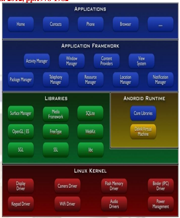
Fig.2.0 android architecture

ANDROID (Automated Numeration of Data Realised by Optimised Image Detection) Android is an operating system for mobile devices such as smart phones and tablet computers. It is developed by the Open Handset Alliance led by Google.