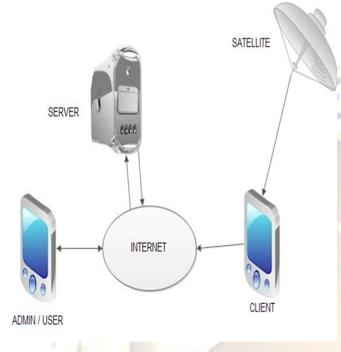
Fig.4.0 system architecture