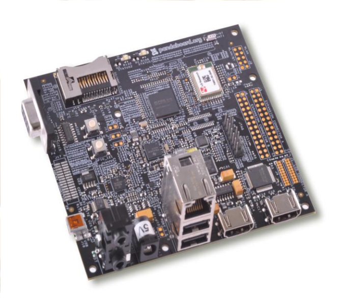
Figure1: Panda Board, an ARM based development board from Texas Instruments.

Texas Instruments implements the ARM architecture in its OMAP processors. For example, Panda Board is a particular variant of the OMAP4 platform. Panda Board is based on ARM Cortex-A9 System-on-Chip (SoC) processor.