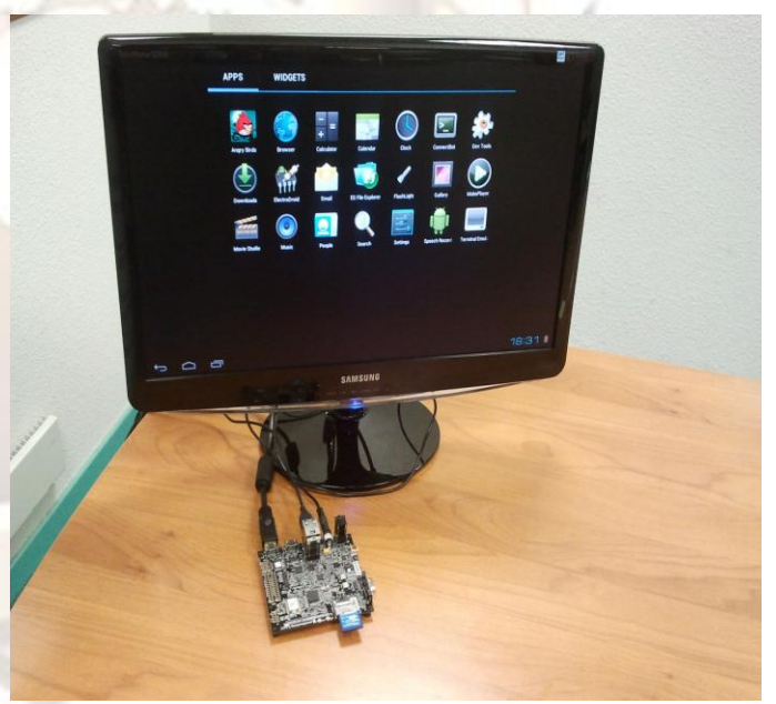
Figure4: Booting up the arm board