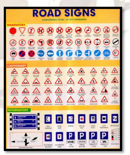
Fig. 2. Indian Traffic Signs

Fig. 2.Shows the traffic signs currently present in India. Basically, the signs are divided into three classes based on its shapes - Circular, Rectangular and triangular. This enhances the processing speed limiting the search in only one of the classes based on the shape.