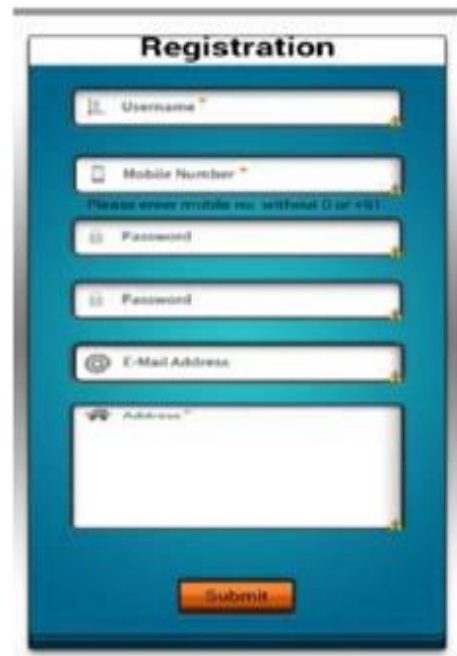
figure 4 Customer registers himself and registered information of particular customer is stored into database.