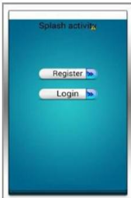
Figure 3 Figure 3 is the first screen on which customer has to register.