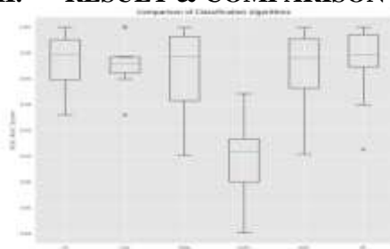
Fig 2: Comparison of Classifier