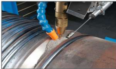
Submerged arc welding