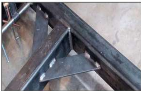
Frame weld joint

There are many different power supplies can be used to provide the necessary energy for arc welding processes. But the most common type used is constant current and voltage supplies. Because, the current related to the amount of heat input, and the voltage, in the other hand is related to the length of the arc. They relatively maintain constant even in high demanding situations.