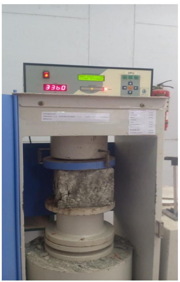
Testing of concrete by compressive testing machine

the compression tests, the optimum percentage of CDA to be added is determined as the one which renders the maximum compressive strength. The cube specimen was taken out from the curing tank after specified curing time and were allowed for dry and the weight of each specimen as well as measure the dimension of the specimen were noted. The specimens were placed in the machine such that load shall be applied to the opposite sides of the specimen, and the specimens were aligned centrally on the base plate of the machine. The movable portion was rotated gently by hand so that it touches the top surface of the specimen. The load was applied gradually till the specimens failed and the maximum load at failure of specimen were recorded. Load was applied at the rate of 140 kN/m<sup>2</sup> . The compressive strength of the specimen was calculated by dividing the failure load by the crosssectional area of the specimen.