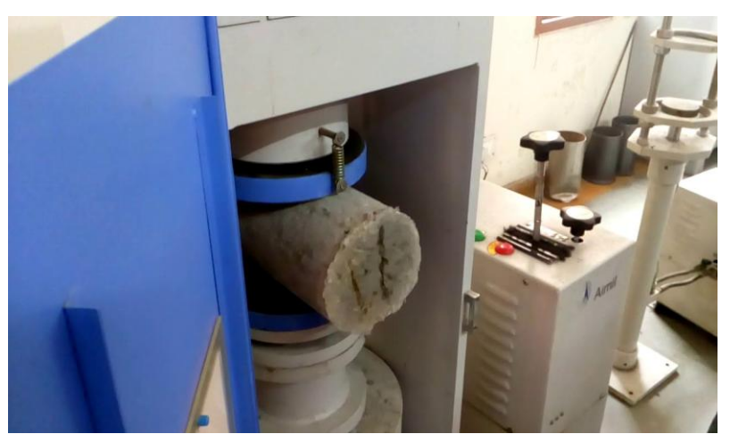
Split tensile strength test