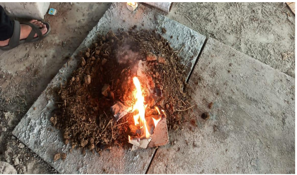
Cow dung ash preparation