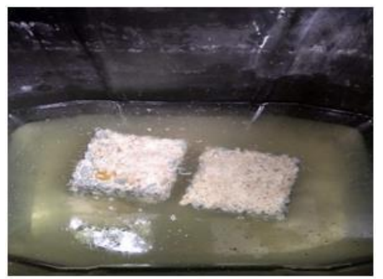
Cubes immersed in acid solution

were stored in solution of 5% sulphuric acid (H_2SO_4) solution. After 28 days of immersion, the concrete cubes were taken out of acid water. Then the specimens were tested for compressive strength. The resistance of concrete to acid attack was found by the percentage loss of weight of specimen and the percentage loss of compressive strength on immersing concrete cubes in acid water. The cube specimens immersed in 5% H_2SO_4 solution.