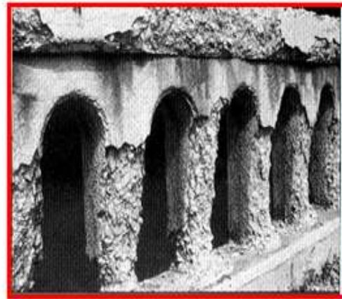
Figure1.2: Freeze Thaw Effect And Cracking In Concrete