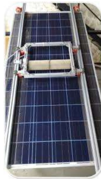
Figure 1: Solar panel cleaning system

The main and prime agenda for developing this system is there are lots of people who cannot buy the automatic cleaning system just because they are pretty costly and thus they tends to go out for reaching to the solar panels and clean them. This act might prove to be life taking and thus they can be safe via using this product.