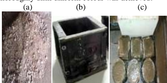
Fig.2. (a) Initial mixing of constituents of HFRC, (b) mould oiled before casting of concrete, (c) mould filled with fresh concrete

polypropylene fibres were added as per the proportions. The mixture was dried mixed until uniform colour of the mixture was obtained and no concentration of any material was visible. The required quantity of water was added into the mix and the whole mixture was mixed. The required quantity of superplasticizer is added to maintain the required workability and the mixture was mixed thoroughly until uniform colour was achieved.