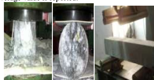
Fig. 3(a) Failure of cube under compression, (b) split tension, (c) flexural test setup

Compressive strength test is initial step of testing concrete because the concrete is primarily meant to withstand compressive stresses. Compressive strength tests were carried out on 150 mm x 150 mm x 150 mm cubes with compression testing machine of 2000 KN capacity. The specimens after removal from the curing were cleaned and properly dried. The surface of the testing machine was cleaned as shown in fig.3 (a). The cube was then placed with the cast faces in the contact with the platens of the testing machine. Cubes were tested at 28 and 56 days of curing. In each category, three cubes were tested and their average value is reported.