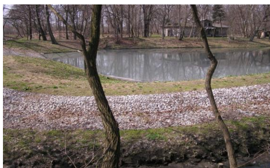
Fig.1. Beręsewicz Pond

probably contaminated by uncontrolled discharge of the wastewater of a domestic or industrial origin. Beręsewicz Ponds The Beręsewicz Ponds system consists of two parts - Upper and Lower pond, located on a total area of 11900 m 2 , characterized by the retention volume of 11400 m 3 (Figure1). They serve as the reservoirs for the excess water of Służewiecki Stream during the spate, preventing the flood danger in the neighbouring areas. For the lower water conditions in the Służewiecki Stream, the water flow through the Beręsewicz Ponds is very low. The water damming point is located between the Służewiecki Stream and the Upper Beręsewicz Pond. In 2004 the ponds were revitalized. It was revealed that a bowl of a pond contains the grounds of the anthropogenic origin (sands, clays, humus, and a brick rubble) as well as organic, alluvial and sandy-glacial soils [6].