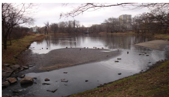
Fig. 2. Wyścigi Pond

Wyścigi Pond (Figure 2) is a flow reservoir characterized by a retention volume of about 17671 m 3 . In 2006 the pond was rebuilt (within the existing pond bowl) to restore the retention and landscaping qualities. The excavated bottom sediments were landfilled in heaps located in the nearby area.