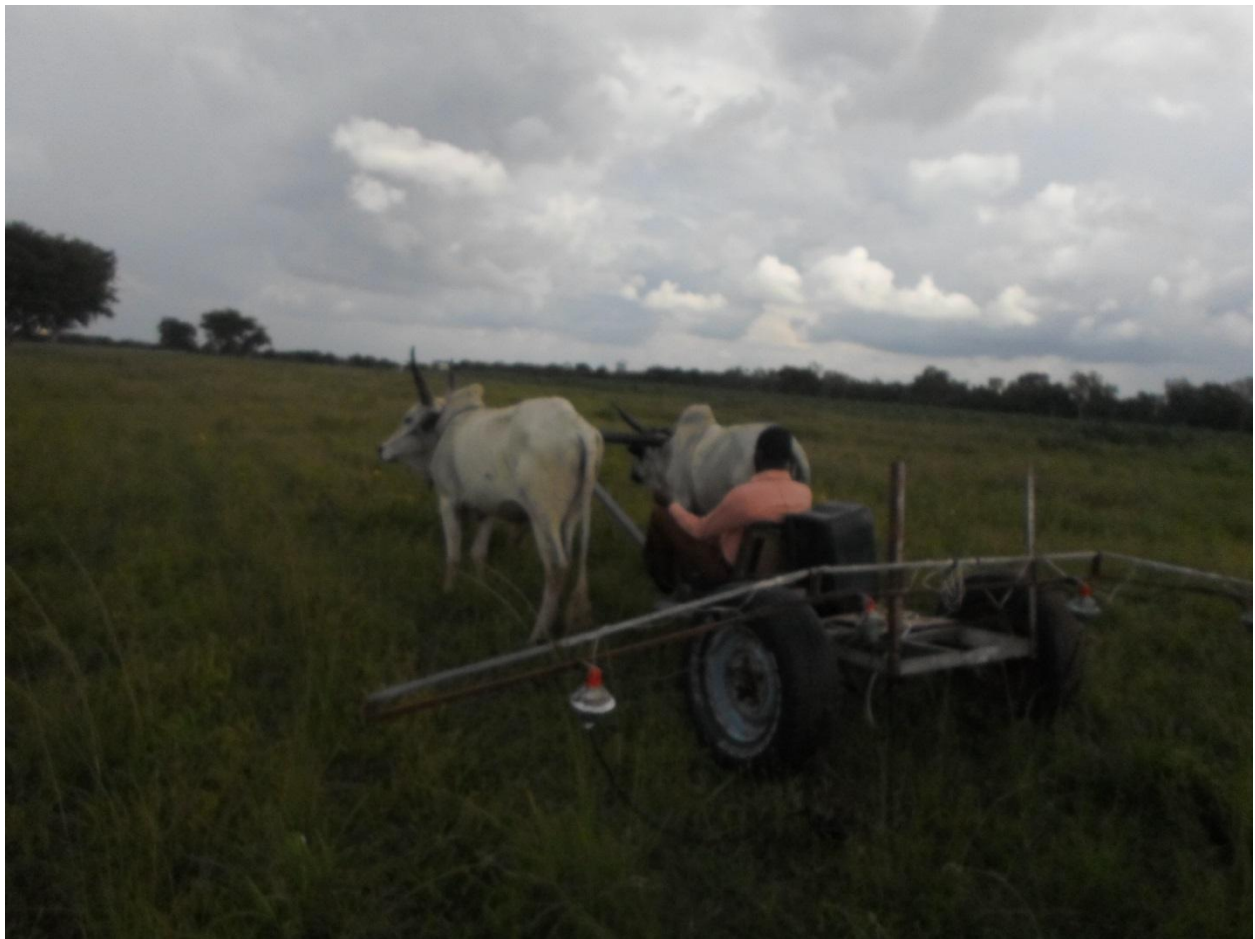
Plate 1: Animal Drawn Ground Metered Axle Mechanism Boom Sprayer in operation.