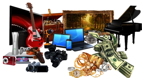
Fig (4) Diagram showing items in the Pawn shop