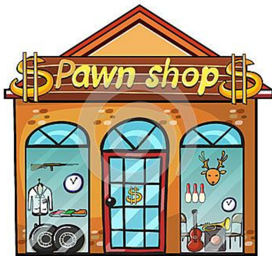
Fig (3) Pawn shop illustration