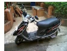
Fig:2 Tvs scooty