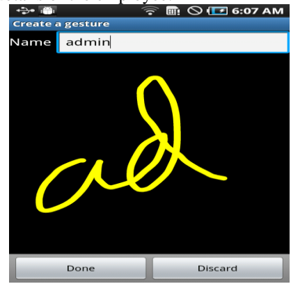
Fig.6 Adding the Signature

The admin has the permission to add the Gesture signature of all the Employees and can view all the details of the employee.