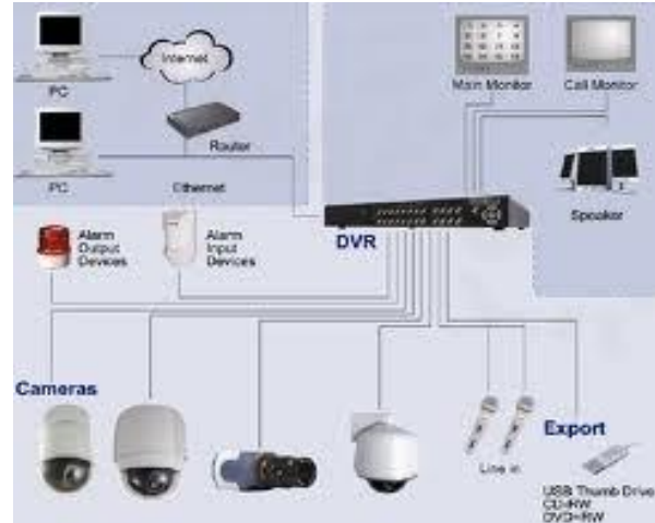
Fig: 4.1 model of proposed system

The working structure of proposed system is like this.