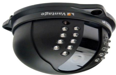
Fig: 2.2 CC camera with high power lenses

The chip which is used for storing the photos is very tiny and it can easily inserted into the cam