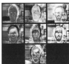
Fig: 5.2: while comparing the seemed like this.

After starting recognition it will scan the photos one by one and they seemed to be a ghost pictures.