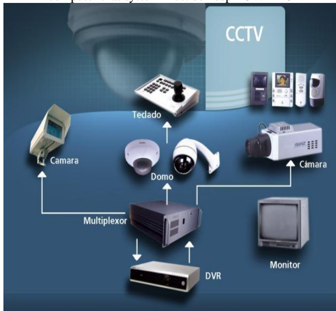
Fig: 3.3 model of existed system

The cam fixed at any place for example if it fixed in front of your home it may connect to TV monitor, or DVR or to the computer. If it connected to computer that system must be keep POWER ON