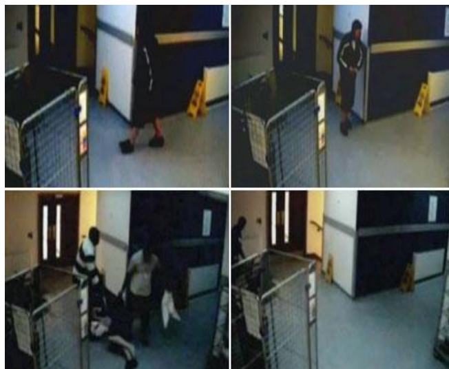
Fig: 6.2.1 monitoring in hospital

Terrorists mainly attack in hospitals because there they can find large number of people and if they attacked anyone the people can't attack them in response.