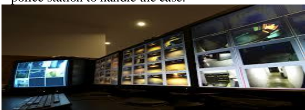
Fig: 2.1 control room monitoring system

There are huge numbers of systems which are connected to the number of CC cams and they will collect all potages in every location. If anyone found suspicious they will inform to the nearer police station to handle the case.