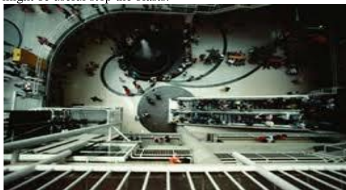
Fig: 6.3.1 monitoring shopping mall from top view

Shopping malls are the correct place to freeze any terrorist. Because most of the terrorists will target the malls and plan for blasts. So if we arrange there it might be useful stop the blasts.