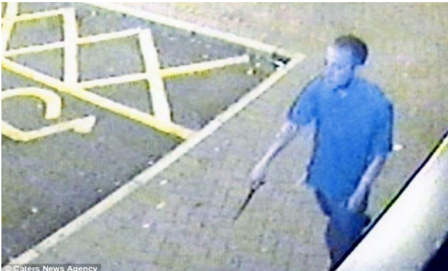
Fig: 6.4.1 monitoring anyone who is carrying weapons on road

Main roads are also plays a crucial role in capturing any terrorist. We can easily trace the person and can freeze him.