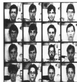
fig: 5.1: eigen matrix of wanted photos

Initially we have matrix set as follows.