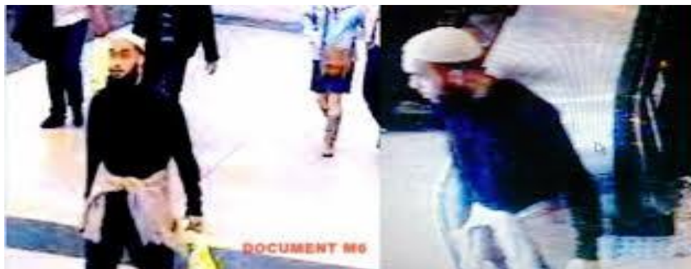
Fig: 6.3.2 monitoring people at malls if they are carrying weapons

Cam can at least scan the items which the people are holding and alert the people if there is any suspicious.