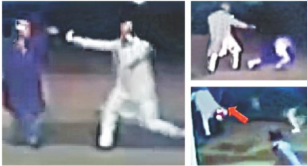
Fig: 3.2 after happening any blast police gathering cam pottages.

The working principle of the existing system is as follows.