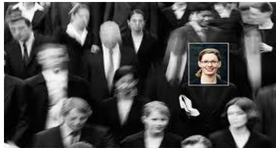
Fig: 2.5 A particular identification

Even though the wanted person is in the group this bi-metric cam can easily trace them and alerts in control room.