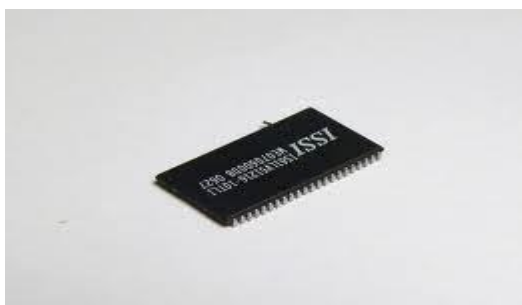
Fig: 2.3 model of micro chip to be inserted

The above is the chip used for storing photos and inserted into the CC cam before fixing it any place. After installing it starts comparing the people