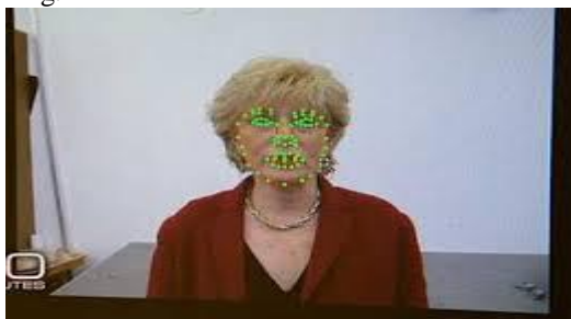
Fig: 6.1.1 staff authentication by face identification

In companies they are used for recognizing the staff and it is also used to calculate their working hours and their attendance. This replaces the system of signing in the register and maintaining the list of late coming.