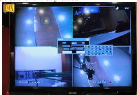
Fig: 3.1 monitoring 3 to 4 cams at a time

Existing system works on the process of recording all the pottages and video clips in large number per second. As per the latest technical developments in the CC cams the latest one can capture up to 30,000 pictures per second. But it needs a large database and that data in data base can be used only when any blasts are occurred and if the clues team approached the control room for clues. Unless and until it happened there is no use of storing that many photos in database. We need a large infrastructure for that process.