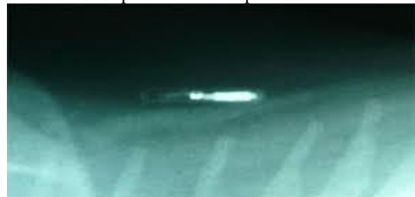
Fig: 1.1 pin cell inserted in human body to trace person

case of the person's photo who is carrying explosive items is not in the chip inserted in CC cam which contains all the photos of the culprits.