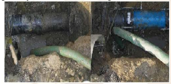
Figure 2.5 mains repaired connection at sector 21

This covers all repairs and maintenance of all water mains and supply pipes greater than 1" in diameter. There are many different types of materials that have been used in the installation of water mains from Asbestos Cement, PVC, Medium Density Polyethylene (MDPE), copper, galvanized iron to the more common ductile and cast-iron. With this there are many fittings to adopt and maintain these different materials for use in repairs to water mains, new connections for supplies to properties and general preservations, refer the Fig. 2.5 below.