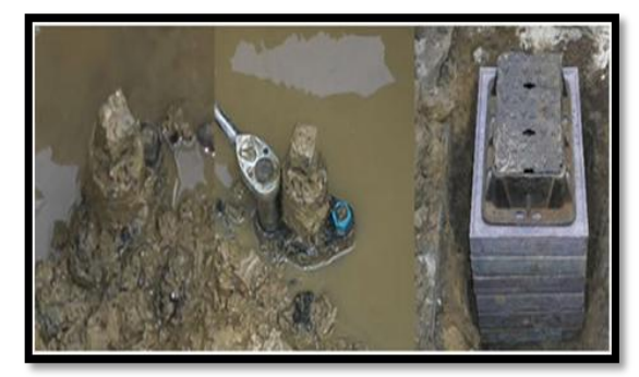
Figure 2.4 sluice valve repair