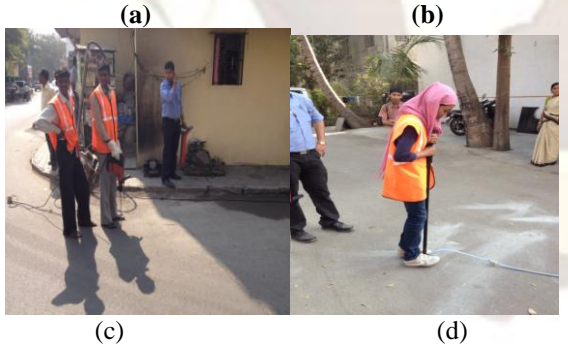
Figure 2.2 Leak detection