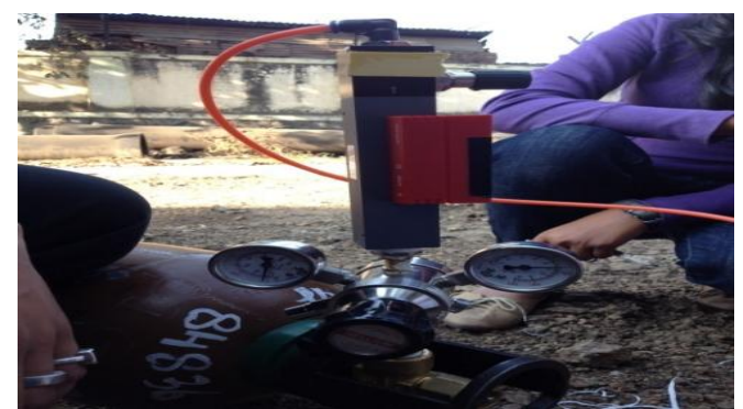
Figure 2.1 Pressure meter with helium gas cylinder