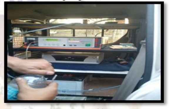
(e) Figure 2.2 Pictures durring leak detection