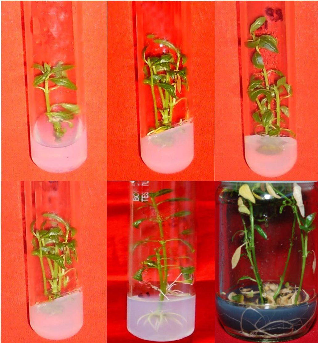
Figure 2: Direct shoot regeneration from nodal explants of Asclepias curassavica on MS and L 2 media supplemented with different combinations and concentration of growth regulators A. direct shoot initiation from nodal explants on MS media with KN (1.0 mg/l) B. shoot multiplication on MS media supplemented with KN (3.0 mg/l) C. elongated shoots multiplied in MS media after frequent subculture D. multiple shoot formation from nodal explants on L 2 media supplemented with BA (3.0 mg/l) E. initiation of rhizogenesis from well developed shoots on MS media F. well rooted plantlets ready for hardening