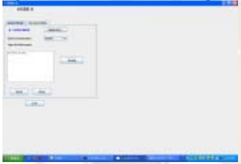
Fig 3: Using the TAODV send the message