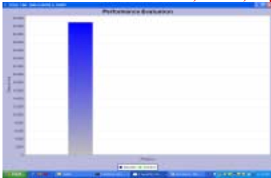
Table 4: Performance of SAODV