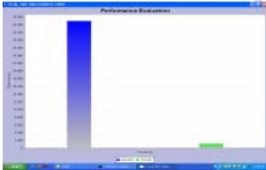
Table 5: Comparison of SAODV & TAODV

The overhead for processing the R ACK message was almost completely due to the recalculation of the OTV and RSV values. The TAODV implementation used double primitives for all calculations in order to keep with the protocol description in [15].