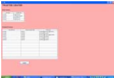
Fig 2: Trusted center for Both the protocols

hash chain operations rapidly to both send and receive routing messages. New data structures were added for SAODV's single signature extension and the necessary code was added to the message processing functions for RREQ, RREP, HELLO, and RERR messages. The design of the AODV implementation allowed SAODV functionality to be implemented while maintaining one binary with the ability to run both protocols.