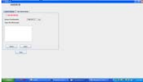
Fig 4: Using the TAODV receive the message