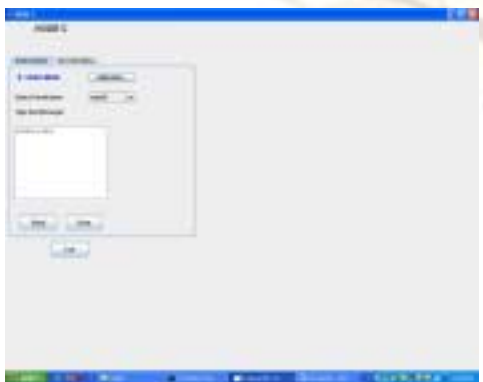
Fig 5: Using the SAODV send the message

Implementing TAODV required many additions similar to those involved in SAODV. New data structures were used for the NTT as well as the extended messages and the new R ACK message. Similarly, message handling functions were updated to use the extensions and take the appropriate actions. One challenge in implementing TAODV was counting packets sent, forwarded, or received for a particular route. While it intuitively seems to be something that should be implemented in the kernel module that is already tied into the net filter framework, this would require extra data exchange between the kernel module and the daemon. Since our implementation already passes packet headers to the daemon for route discovery initiation and flagging, it was simply necessary to place the counting mechanism in the daemon.