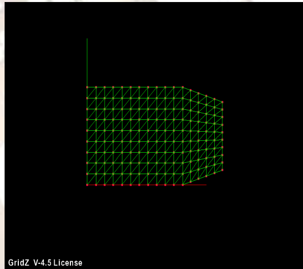
Figure 3: Basic geometry of nozzle